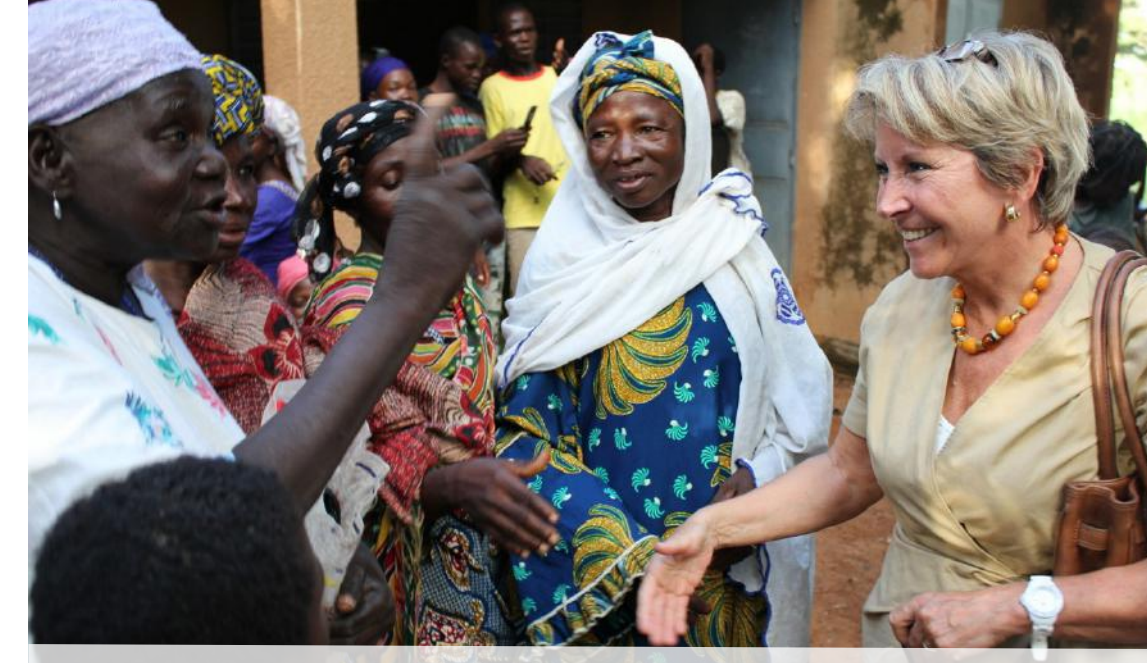
Belgian Senator and AWEPA member Hon. Dominique Tilmans meets local communities during an AWEPA FGM/C sensitisation workshop inBurkina Faso (September 2012).

In the European Union, Finland, Italy and Portugal are implementing specific national action plans to eradicate FGM/C. In other countries, such as Belgium, Croatia, France, Spain, Slovakia and the UK, FGM/C is included in other national strategies. In many occasions, NGOs have been the driving force in putting the issue of FGM/C on the national agenda.