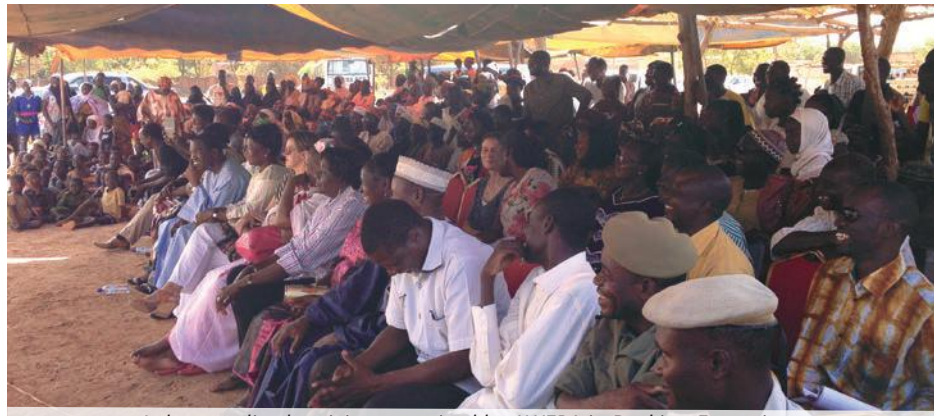
A decentralised activity, organised by AWEPA in Burkina Faso aims to change perceptions surrounding FGM/C (November 2013).

A State Party to the CRC, the African Charter on the Rights and Welfare of the Child (ACRWC), the CEDAW and the Maputo Protocol, is under the obligation to take all appropriate measures to eliminate FGM/C, including through preventive measures.<sup>82</sup> In Italy, the law sets forth not only judicial measures, but also preventive measures regarding FGM/C, such as promotion and coordination activities, information campaigns, training for healthcare personnel, the creation of a toll-free telephone number to report cases and to provide information. Such anti-FGM/C measures are incorporated in Italy's international cooperation programmes.<sup>83</sup>