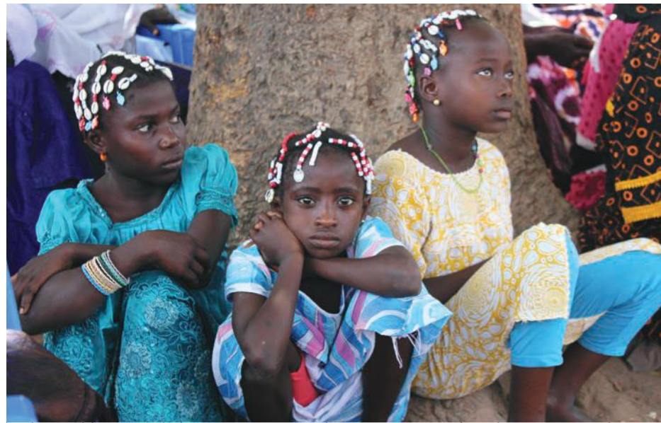
Girls in Kolda, Senegal, during an AWEPA parliamentary outreach to the region (March 2013).

In communities where FGM/C has a high social value, girls and women who are not mutilated may be ostracised by their communities. Genitally mutilated women in migrant communities may face problems concerning their sexual identity when confronted with non-mutilated Western girls, women, and the strong opposition against FGM/C in their host country.